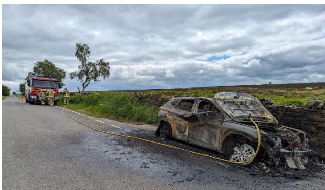
One of our poor members car!!